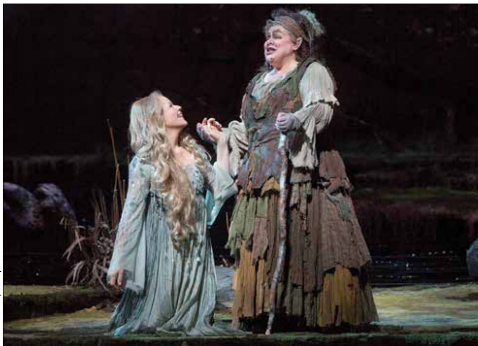
GREAT PERFORMANCES AT THE MET Rusalka Saturday, September 6, 7:30 pm Renée Fleming in the title role and Dolora Zajick as Jezibaba.