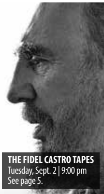
THE FIDEL CASTRO TAPES Tuesday, Sept. 2 | 9:00 pm See page 5.