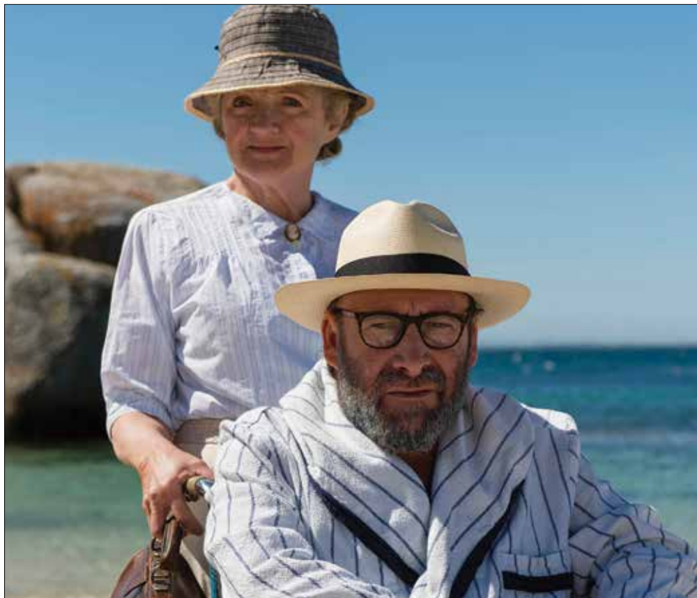
ITV Studios for MASTERPIECE

Midnight GREAT PERFORMANCES AT THE MET Rusalka