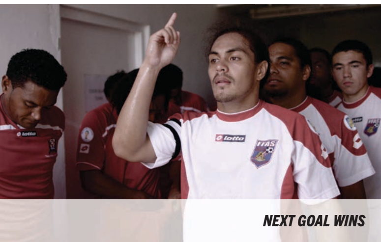
NEXT GOAL WINS