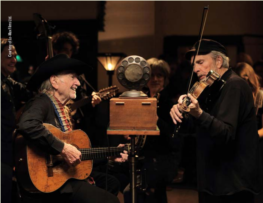
Willie Nelson and Merle Haggard are featured performers on The American Epic Sessions , Tuesday, June 6 at 8:00 pm.

To imagine where Hawai'i would be without its music is nearly impossible. A pillar of our culture, our music tells our origin story, and acts as a map of our discoveries, our breakthroughs and our connections.