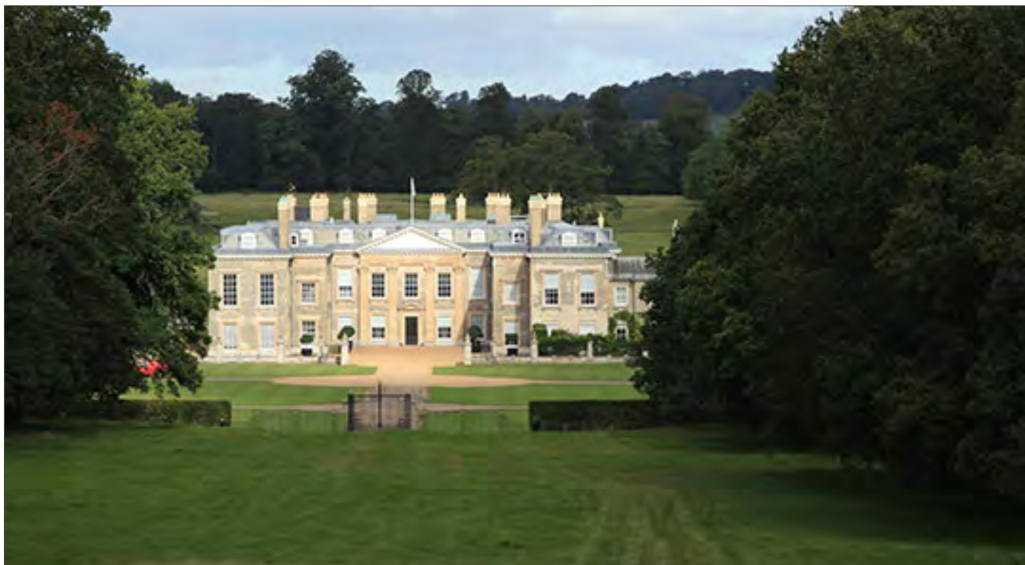
SECRETS OF ALTHORP: THE SPENCERS Sunday, July 7 | 7:00 pm Pictured: Althorp House, Seat of the Earls Spencer

9:00 SECRETS OF THE DEAD Ultimate Tut Ninety years ago in Egypt's Valley of the Kings, the greatest archaeological find in history was made: the discovery of Tutankhamen's tomb and its golden treasures. But the real story has become shrouded in myth, with many