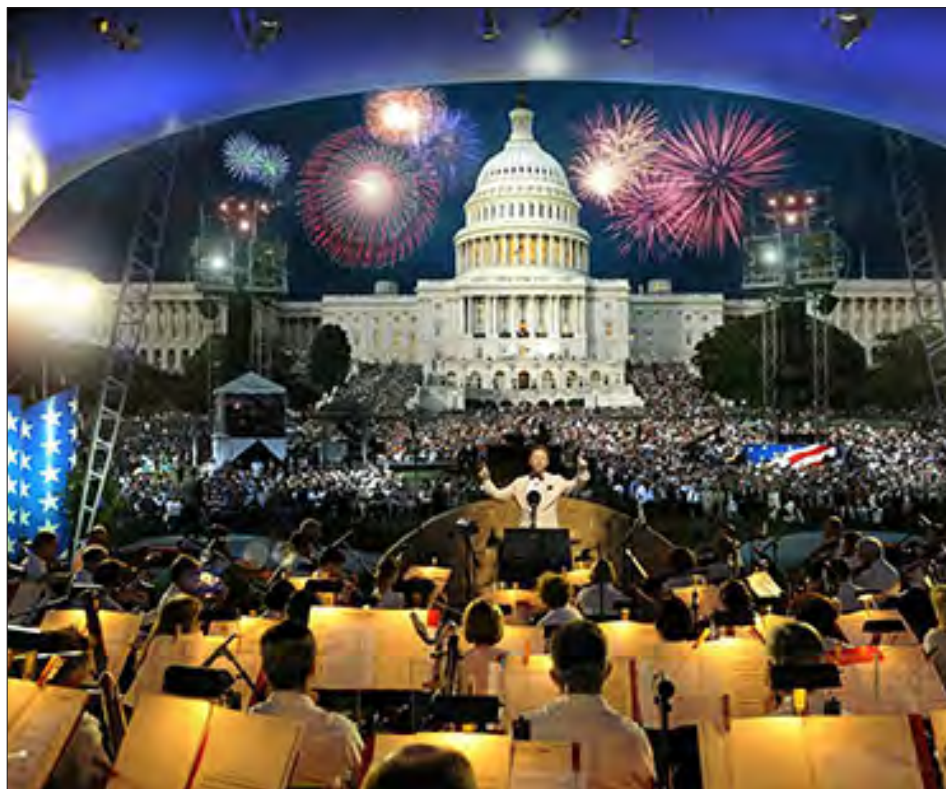
A CAPITOL FOURTH Thursday, July 4 | 8:00/9:30 pm Pictured: National Symphony Orchestra