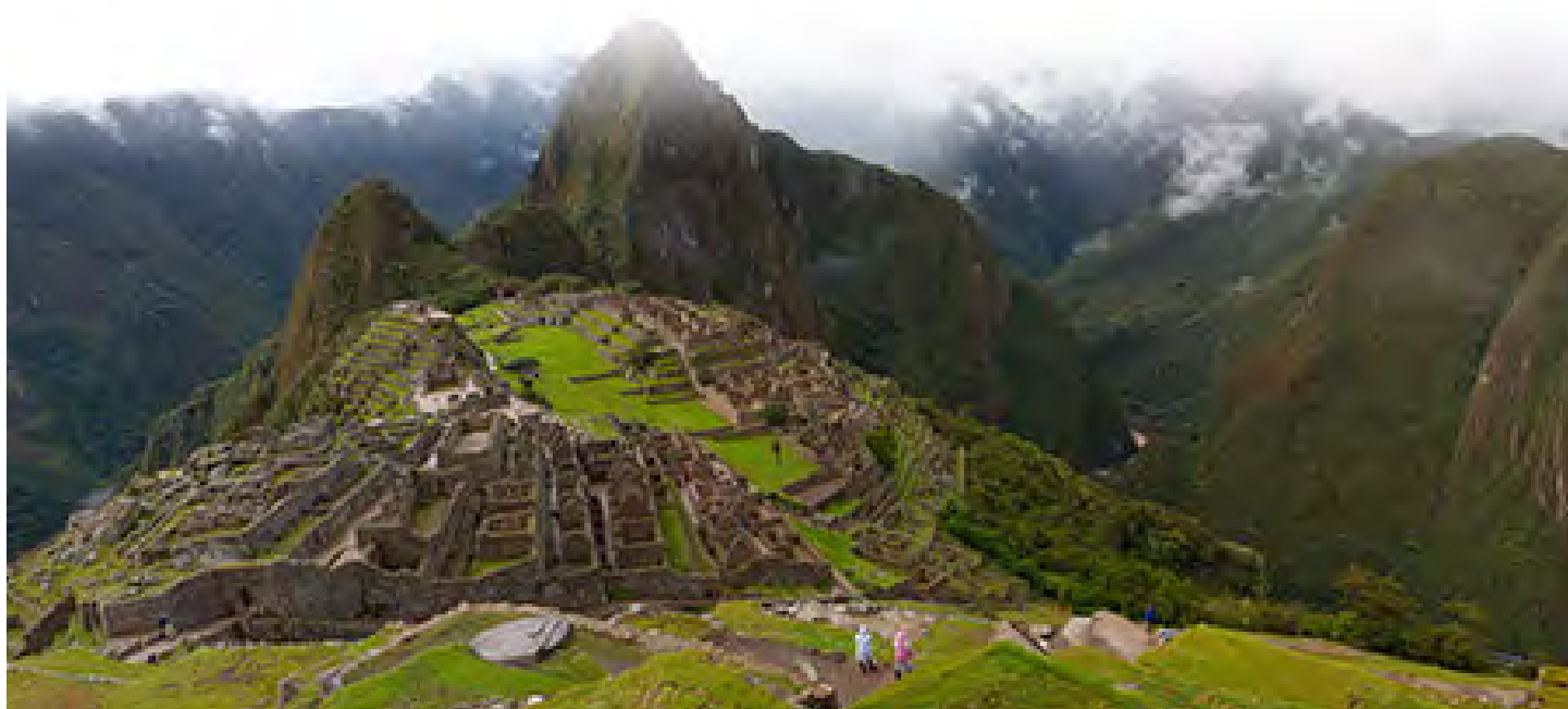
RICHARD BANGS' SOUTH AMERICA: QUEST FOR WONDER Saturday, July 6 | 8:00 pm Pictured: Architectural ruins of Machu Picchu in Peru