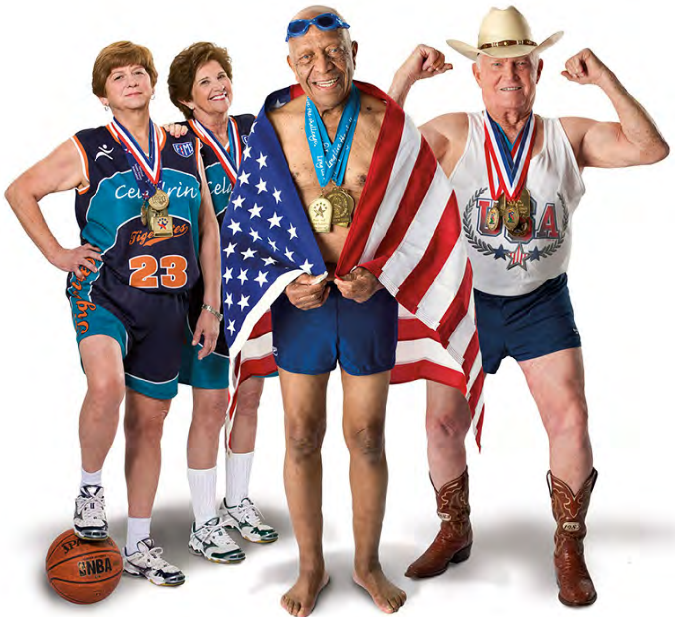
AGE OF CHAMPIONS Saturday, July 13 | 8:00 pm Pictured: Competitors who sprint, leap and swim for gold at the National Senior Olympics See page 12.

mysteries around the tomb unsolved to this day. This special combines the latest evidence from a team of archaeologists, anatomists, geologists and Egyptologists to build the ultimate picture of Tutankhamen.