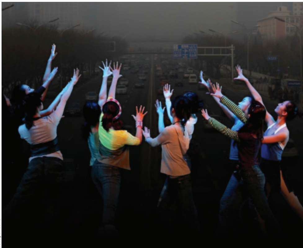
ROAD TO FAME Saturday, January 17, 8:00 pm

Students from China's top drama academy produce a staging of the musical Fame .