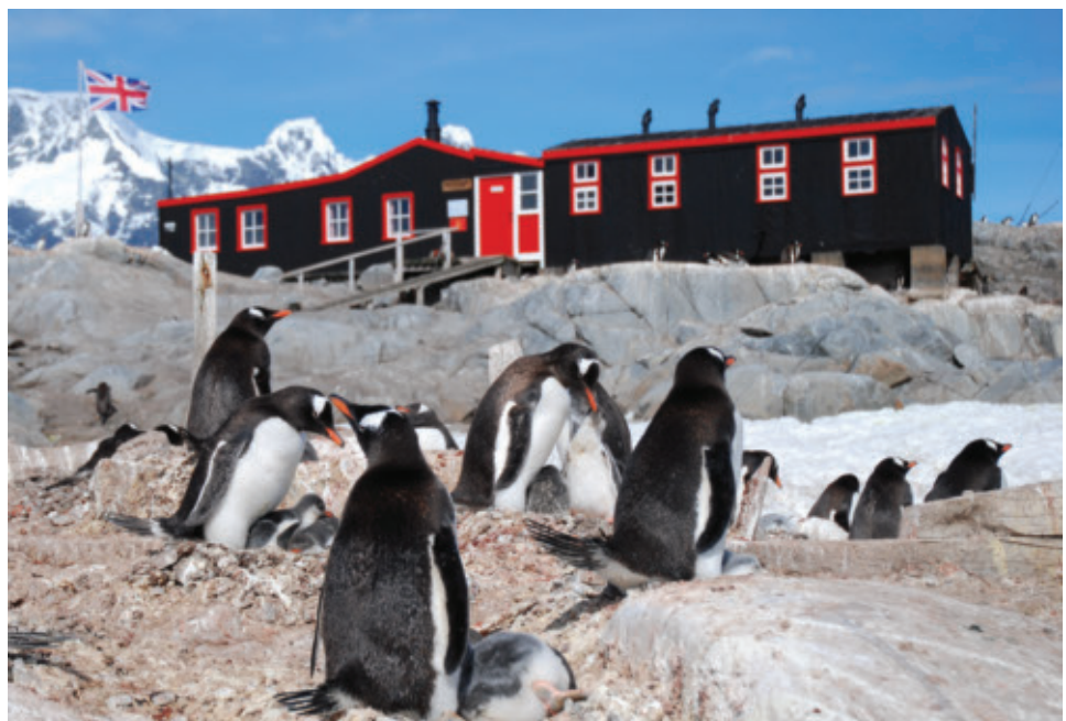
NATURE Penguin Post Office Wednesday, January 28, 8:00 pm Gentoo penguins congregate near a remote Antarctic post office for mating season.