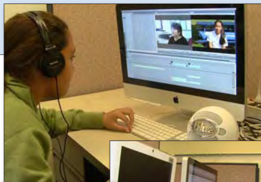
Pictured: Students from west Kauai's Waimea Canyon Middle School.