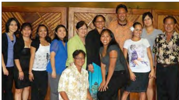
Marians Island Wide Catering staff

Since 1956, Marians Island Wide Catering has been providing excellent local food for a wide range of