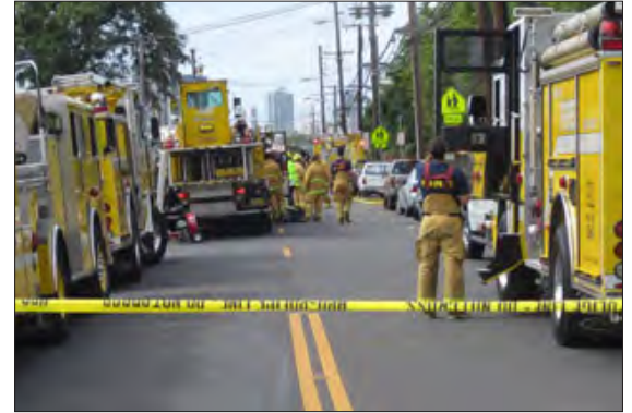
Access was restricted on Dole and adjacent streets as police and firefighters responded to the fire.

PBS Hawaii's fire was more serious. Our exploding light was a high-intensity bulb from a large fixture next to our cyclorama (known in the TV biz as a "cyc"), a wall meant to give the look of infinity. As firefighters trained water on the fire, they