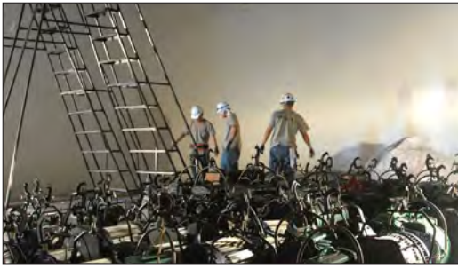
Specialty contractors work around studio lights.