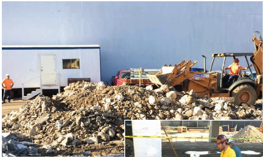
Above: Workers remove concrete from the existing building of the former KFVE Newsplex.

We’d love to hear from you! Your name can become part of this NEW HOME, The Clarence T.C. Ching Campus, for a donation of $500 or more. And with larger amounts, there are excellent naming opportunities, such as a Keiki Neighborhood, HIKI