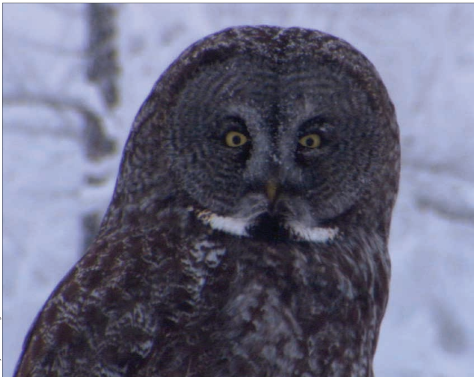
NATURE Owl Power Wednesday, February 18, 8:00 pm

Take a new look at owls in more detail than ever before to discover what makes these creatures so fascinating.