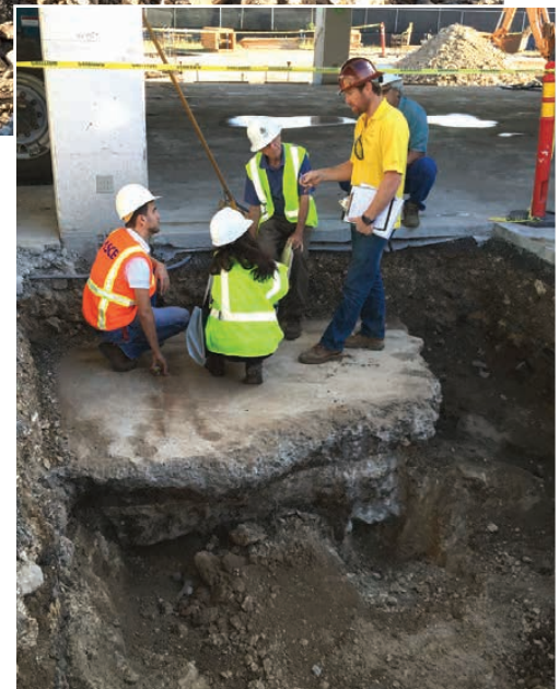
Workers meet in the pit that will become an elevator in our NEW HOME.

NŌ editing suite, and an emergency broadcast center.