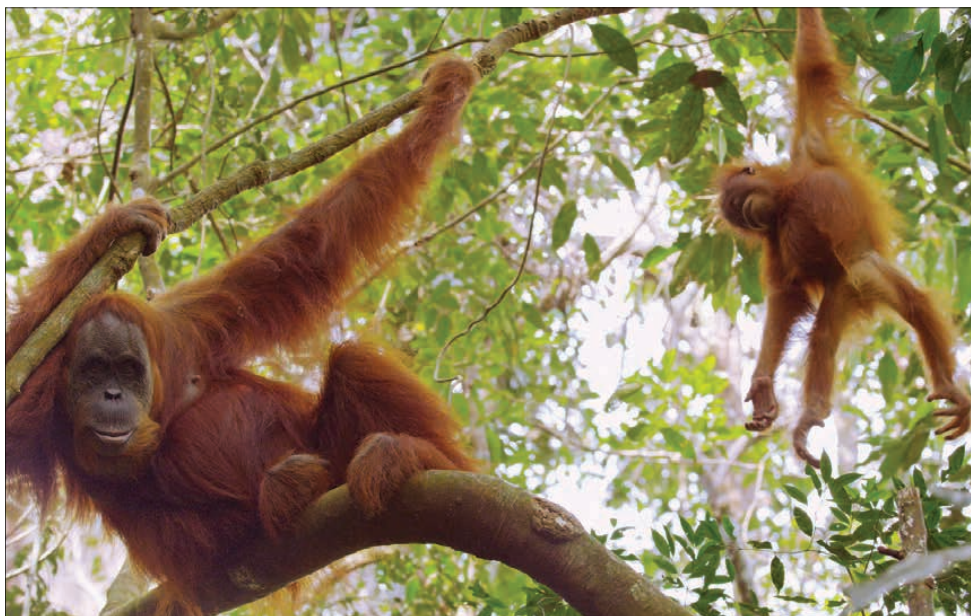
NATURE The Last Orangutan Eden Wednesday, February 25, 8:00 pm Follow the efforts to save the dwindling wild orangutan population in the jungles of Northern Sumatra.