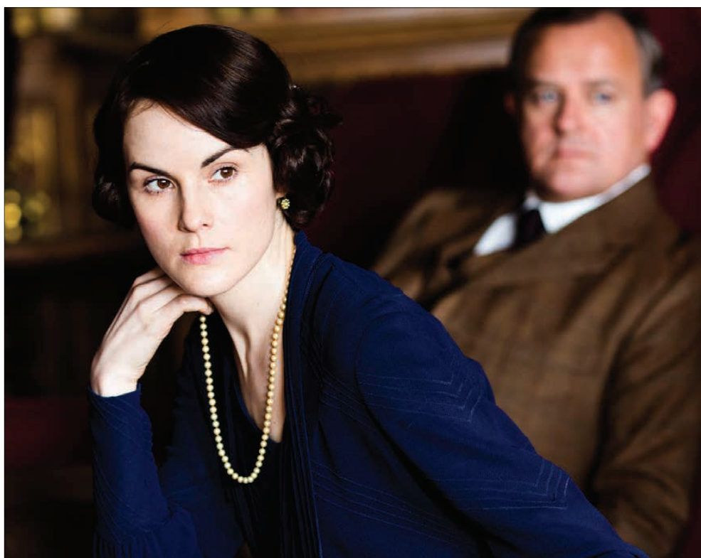
MASTERPIECE CLASSIC Downton Abbey, Season 5 Sundays at 8:00 pm

3:00 AMERICAN EXPERIENCE The Forgotten Plague