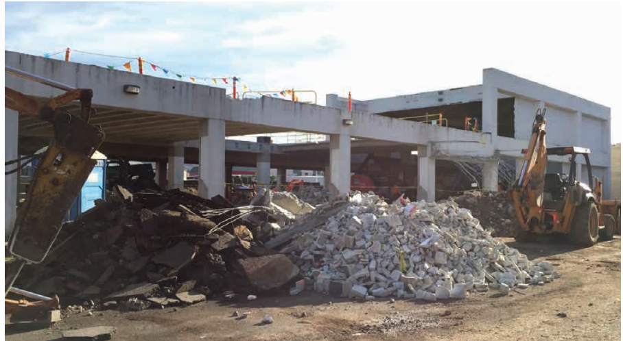
Demolition is underway at our NEW HOME location, an acre-sized lot at the entrance to Sand Island Access Road. Work also begins on strengthening infrastructure to construct a second story.

As the work visibly progresses to add a second story and create a modern educational media center serving all islands, more people are taking an interest and even volunteering hands-on help. We try for a personal touch at this statewide TV station – and we're thrilled when viewers reach out to us, too.